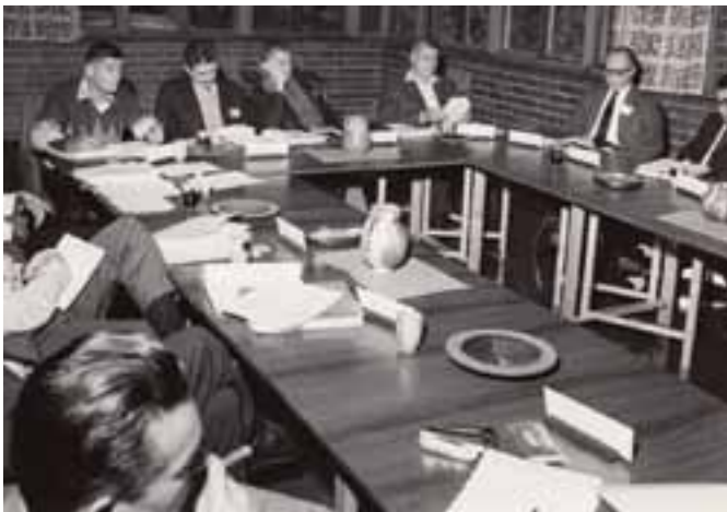
The 1967 Wingspread Conference